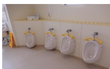
Urinals for toddlers