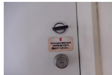
②-b Deadbolt lock on white colored sliding door