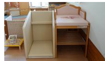
Wet diaper changing table