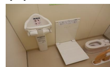
Family bathroom includes a baby chair with safety belt and fitting board