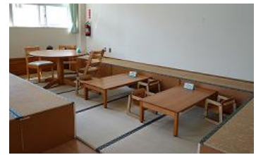
space for rest and refreshment at the corner