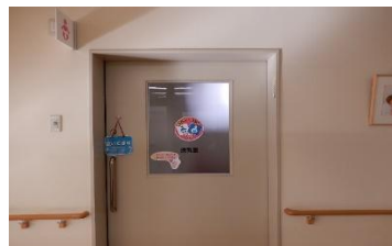
Door to the nursing room