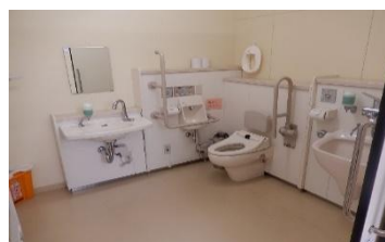
Large diaper changing table and a baby chair with safety belt in handicap accessible multipurpose bathroom