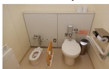
Family bathroom includes a regular size toilet with toddler size toilet