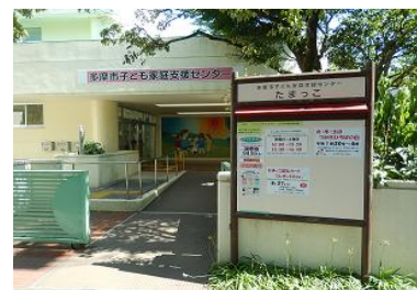
The main entrance

① The main entrance is located on the side next to the Kotta River.