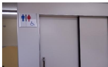
Handicap accessible multipurpose bathroom