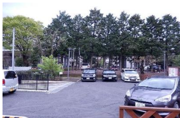
②-a Parking lot