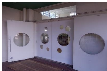
②-b The white colored sliding door