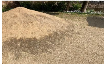
Building a mountain