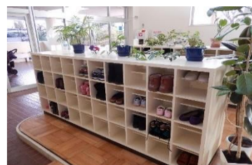
Shoe box at the entrance