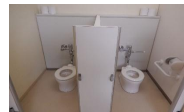
Toilets for toddler