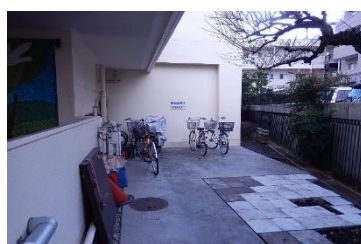
①—a Bicycle parking area