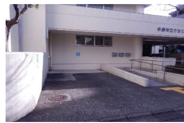
①—c Handicapped parking space next to the main entrance