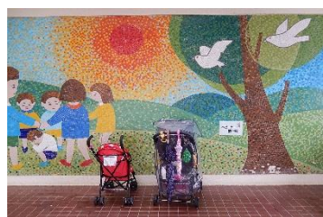
①—b Stroller parking at the main entrance